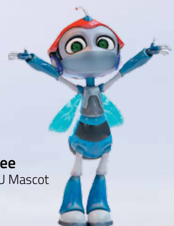
E-Bee MMU Mascot

This is an AR marker. Scan the MMU mascot to watch the video or view 360 video.